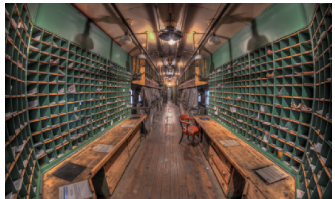
Digital by Cliff Loehr